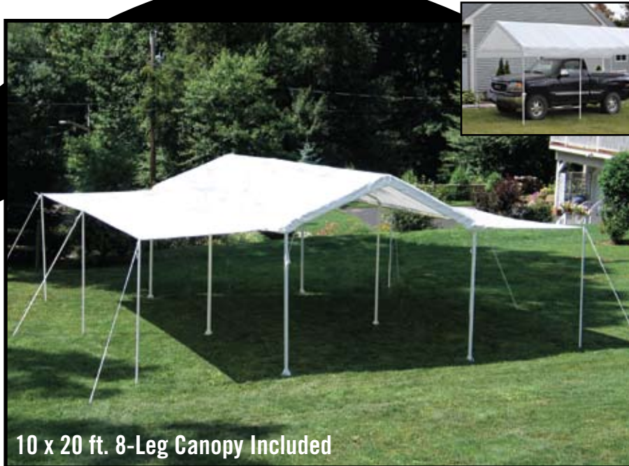
10 x 20 ft. 8-Leg Canopy Included