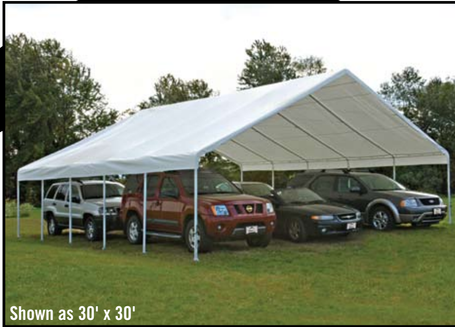
Shown as 30' x 30'