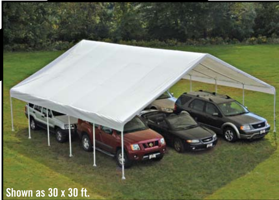
Shown as 30 x 30 ft.